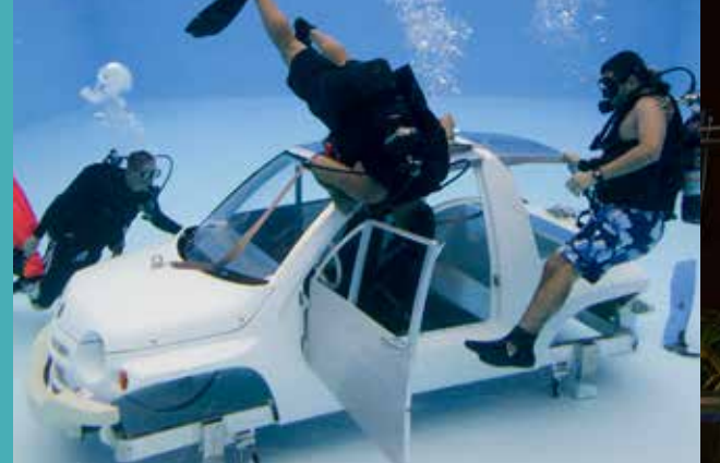
300 PROGRAMS AND PATHWAYS • 8 CAMPUSES • ATHLETICS • STATE-OF-THE-ART TECHNOLOGY