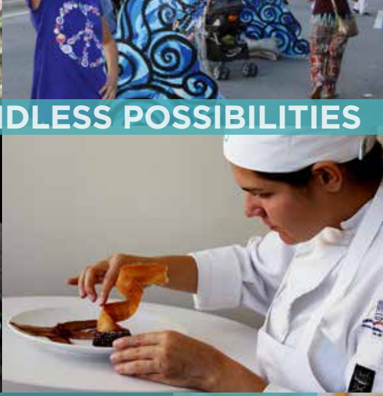
STUDENT LIFE • NOTABLE ALUMNI • ENDLESS POSSIBILITIES